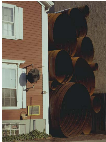
Public Art/Moving Site

New Haven International Festival of Arts & Ideas, CT New Mexico State University, Las Cruces, NM New Mexico Technical University, Socorro, NM New Orleans Ballet Association, Metairie, LA New World Theater, Amherst, MA