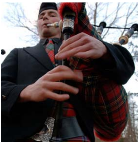
MacTalla M'or Band New England States Touring funded The Glasgow Lands Scottish Festival to showcase MacTalla M'or at their annual Scottish festival in Northhampton, MA. MacTalla M'or presents a variety of genres from Traditional Celtic to Afro-Cuban Rhythms.