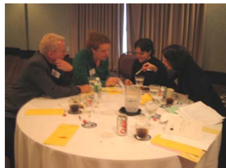
NEFA's 5th Annual Idea Swap event (November 2006) The Idea Swap is an annual networking event for New England-based nonprofit presenting organizations to share touring project ideas that may qualify for funding from NEFA's Expeditions program. In this photo, presenters and artists share ideas and collaborate.