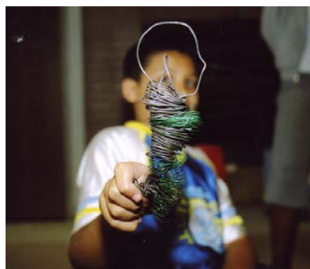
Speaking Out, Community Art at Work