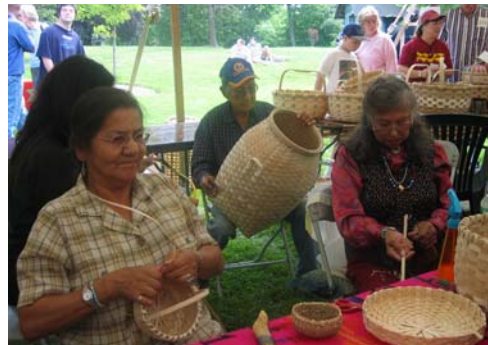
Maine Indian Basketmakers Alliance

As creative economy research becomes more and more widespread, the term 'creative economy' has taken on different meanings to different communities. To promote clarity and consistency in creative economy research, NEFA has refined its creative economy research model to define a framework of industries and occupations that are measured in NEFA's creative economy analysis and reporting, and can also be used by others conducting similar research in their own communities. Development of the new model was greatly informed by a NEFA-hosted convening of researchers and practitioners in 2006. Other activity in this area include: Counting on Culture, the New England Cultural Database and MatchBook.org.