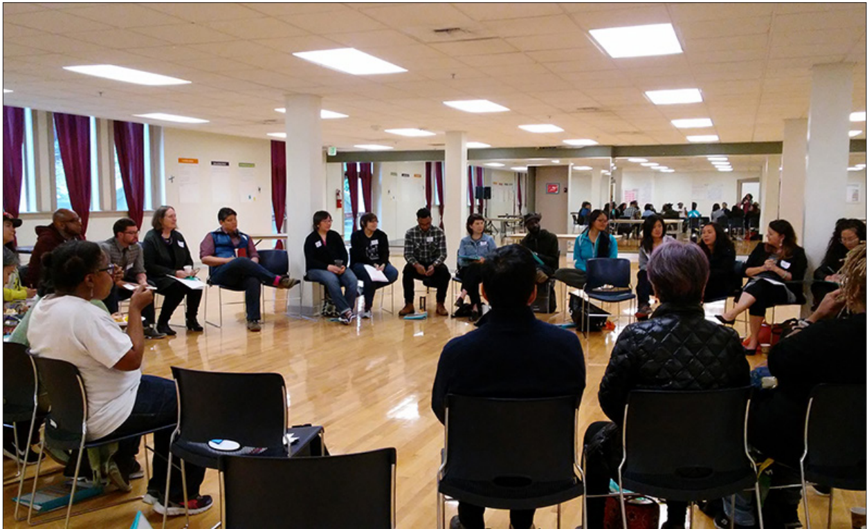
Building Art Space Equitably (BASE) cohort meeting

In the fall of 2017, with funding from the Doris Duke Charitable Foundation, we were able to expand the group of five to a racially diverse group of twelve and to hire a Project Manager/Facilitator to support us in reaching our goals. After a period of recruitment, we began meeting as a steering committee, remotely and in person, for conversations, racial justice trainings, and—at the heart of it—for support in operationalizing equity practices in the organizations where we work. As a “leave-behind” from our work together we created this RE-Tool for racial equity in the panel process.